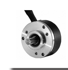
Encoders and Resolvers