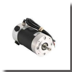
DC Servo Motors