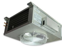
Fluid Cooling Systems