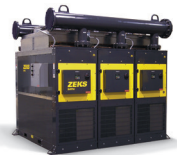
Air Dryers & Air Filters