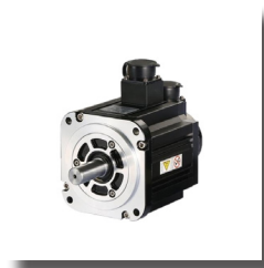
AC Servo Motors