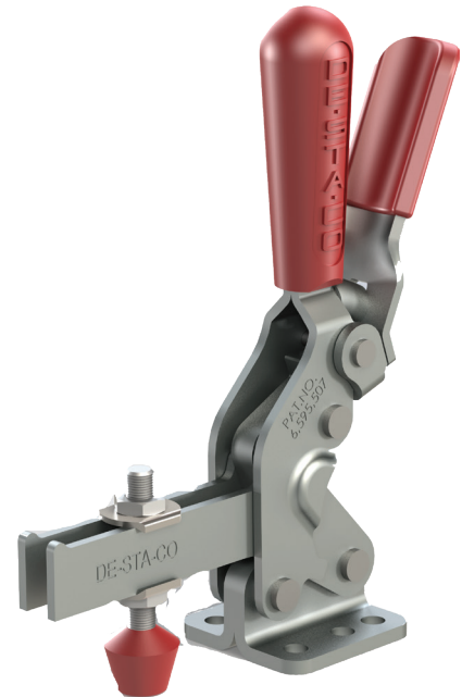
Toggle Lock Plus