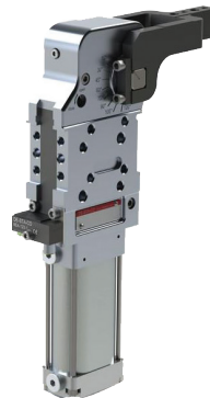
Enclosed Power Clamp

To learn more about how manual/power clamps might benefit you or to hear more on our cutting-edge pneumatic products, value-add and design capabilities, please contact our Pneumatic Automation department at 651.452.8452, email FluidPower@jhfooster.com or visit www.jhfooster.com .