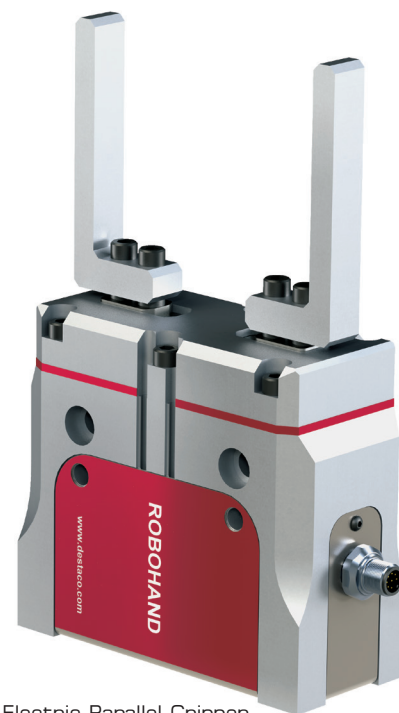
Electric Parallel Gripper