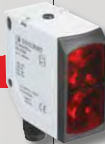
FT 55 R – Proximity switch