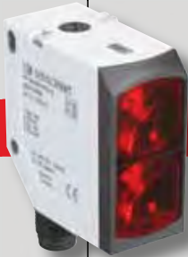
FT 55 RH – Proximity switch with background suppression