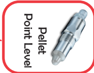
Pellet Point Level