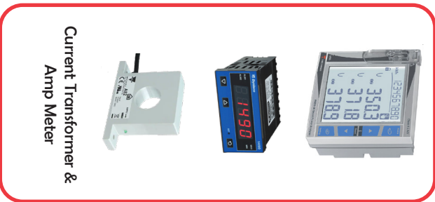
Current Transformer & Amp Meter