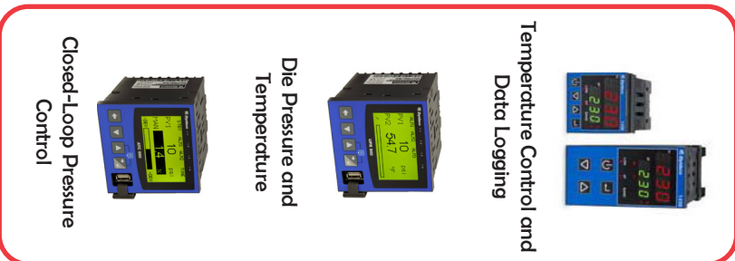
Temperature Control and Data Logging